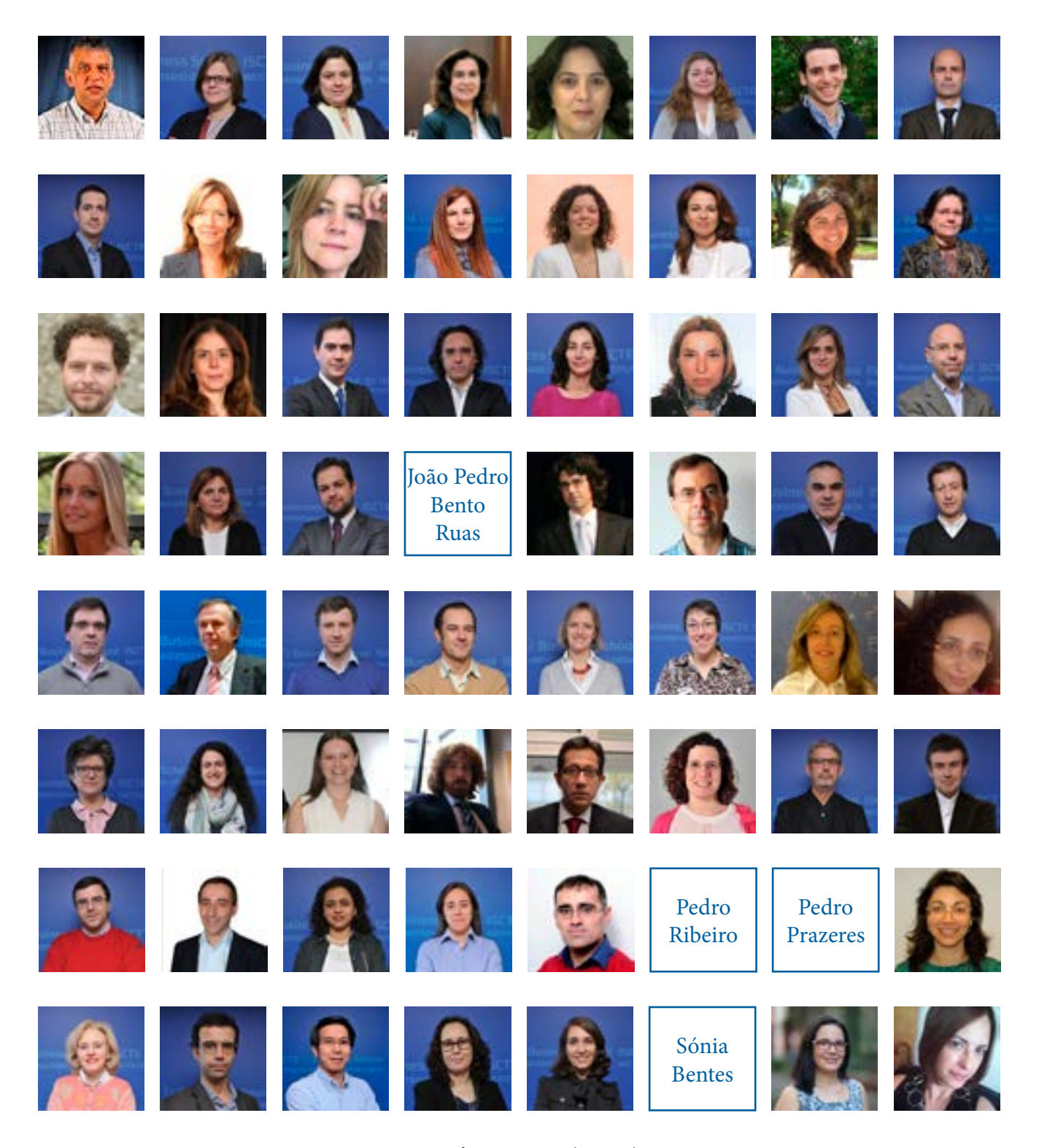
Figure 2: BRU-IUL's integrated members in 2017